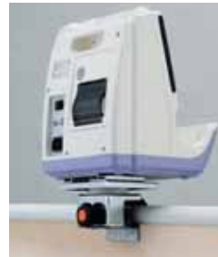
Bed-pipe Clamp HM-15