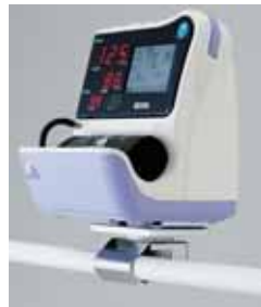
Bed-pipe Clamp HM-14