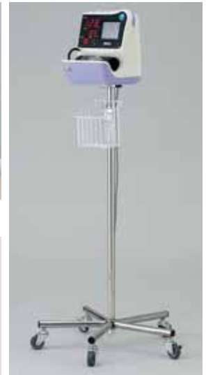
Mobile Cart HM-13