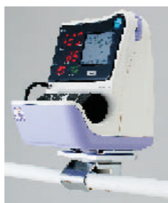
Bed-pipe Clamp HM-14