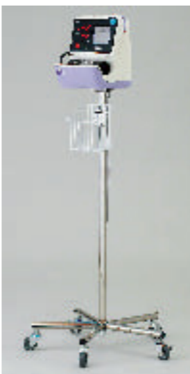
Mobile Cart HM-13