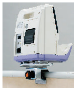
Bed-pipe Clamp HM-15